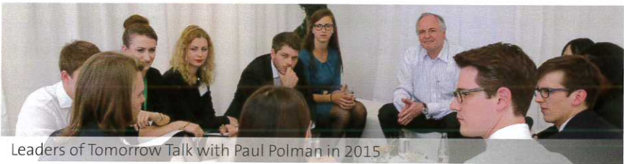
Leaders of Tomorrow Talk with Paul Polman in 2015

The 100 best competitors get invited to the 47 th St. Gallen Symposium. To win the award, the six finalists will compete against each other on the symposium’s big stage and convince the jury of their ideas. The three very best candidates will receive the prestigious award.